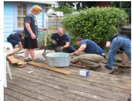
Repairing the ramp

Johnston Memorial Scholarship Fund – In 1998, a Fire District firefighter was killed in a tragic fall. In his memory, Fire District employees initially established a special fund within the Foundation to assist his teenage daughter with her college education expenses. The Foundation has since built upon this effort, expanding its scope to provide three scholarships each year to College students who have chosen to pursue a course of study related to emergency services professions.